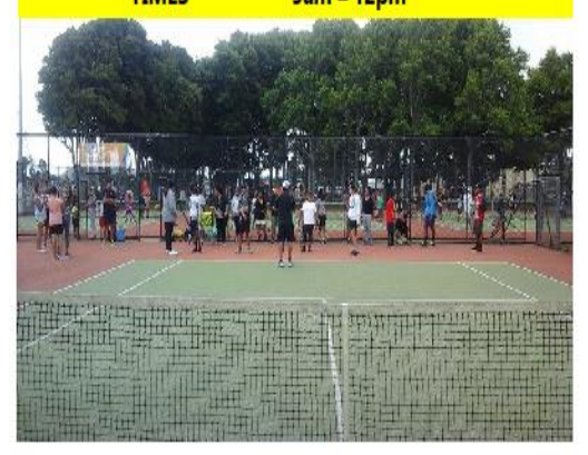
JUNIOR COACHING PROGRAMMES STARTING TUESDAY 10 SEPTEMBER

SATURDAY 7<sup>th</sup> Sep SUNDAY 8<sup>th</sup> Sep TIMES 9am – 12pm