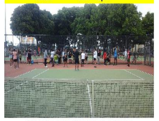
JUNIOR COACHING PROGRAMMES STARTING TUESDAY 10 SEPTEMBER

SATURDAY 7<sup>th</sup> Sep SUNDAY 8<sup>th</sup> Sep TIMES 9am – 12pm